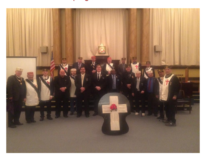
18<sup>th</sup> Degree Team with Spring 2016 Class Members