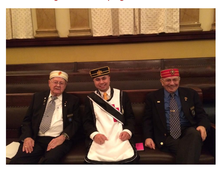
The heart and soul of the Valley of Bremerton